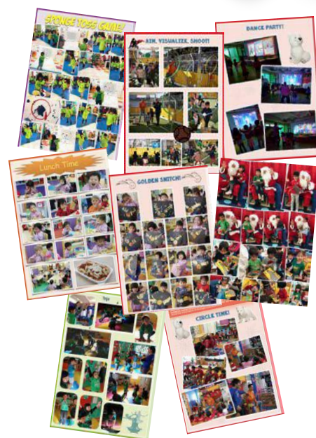
Sample of past Winter School newsletters

You will also receive a set of forms to sign. In this authorization pack you will be asked to sign a notice that gives us permission to photograph and record your child. Unfortunately it isn't possible in the Seasonal School periods to segregate individual children or make special arrangements whilst recording. We are here to answer any of your questions.