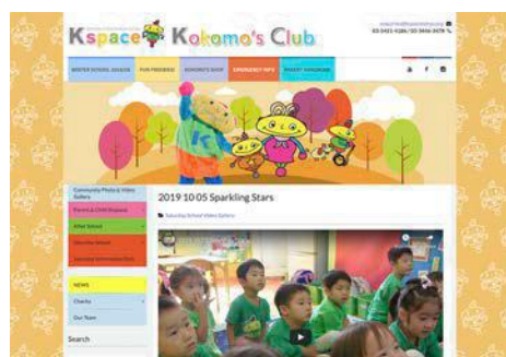
Kokomo Club Private Members' Web Example