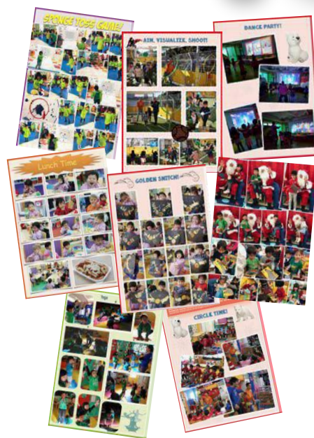
Sample of past Winter School newsletters

You will also receive a set of forms to sign. In this authorization pack you will be asked to sign a notice that gives us permission to photograph and record your child. Unfortunately it isn't possible in the Seasonal School periods to segregate individual children or make special arrangements whilst recording. We are here to answer any of your questions.