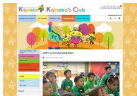
Kokomo Club Private Members' Web Example