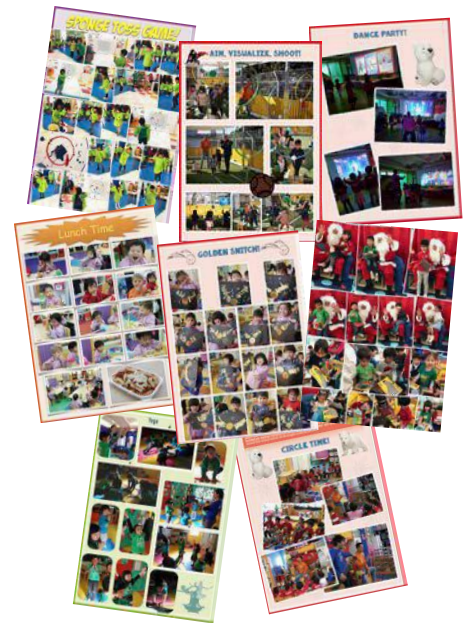
Sample of past Winter School newsletters

You will also receive a set of forms to sign. In this authorization pack you will be asked to sign a notice that gives us permission to photograph and record your child. Unfortunately it isn't possible in the Seasonal School periods to segregate individual children or make special arrangements whilst recording. We are here to answer any of your questions.