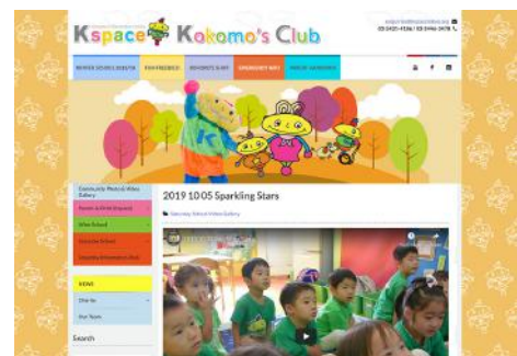
Kokomo Club Private Members' Web Example