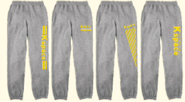
Dark Grey Sweatpants (4 designs)