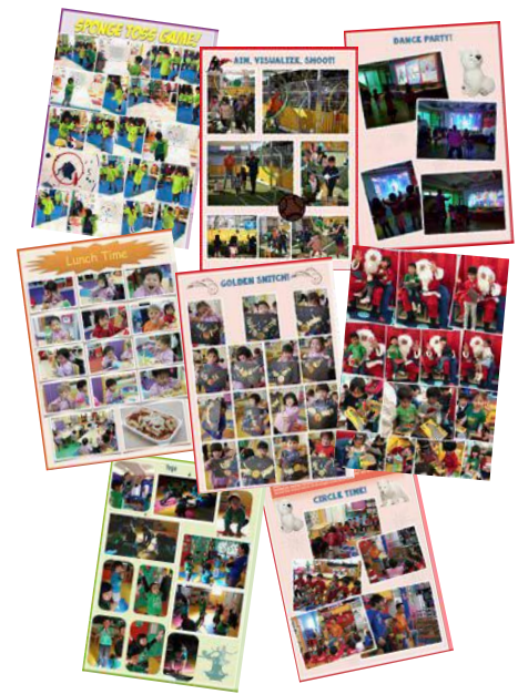
Sample of past Winter School newsletters

You will also receive a set of forms to sign. In this authorization pack you will be asked to sign a notice that gives us permission to photograph and record your child. Unfortunately it isn't possible in the Seasonal School periods to segregate individual children or make special arrangements whilst recording. We are here to answer any of your questions.