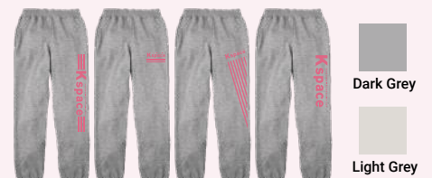
Dark/Light Grey Sweatpants (4 designs)