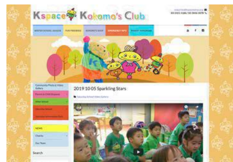
Kokomo Club Private Members' Web Example