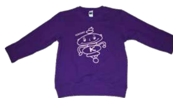
Purple Long-sleeved T-shirt & Sweatshirt