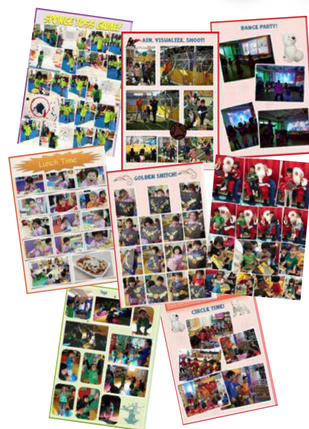
Sample of past Winter School newsletters

You will also receive a set of forms to sign. In this authorization pack you will be asked to sign a notice that gives us permission to photograph and record your child. Unfortunately it isn't possible in the Seasonal School periods to segregate individual children or make special arrangements whilst recording. We are here to answer any of your questions.