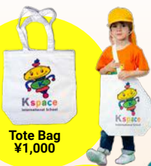
Tote Bag ¥1,000

Only soft slip-on plimsolls/上履き are allowed inside the school. White or Black (Note: not for sale at Kspace) Regular sneakers/trainers, Uggs, boots, sandals, Crocs, wellies etc. are not allowed inside.