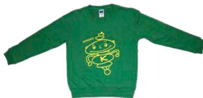
Green Long-sleeved T-shirt & Sweatshirt