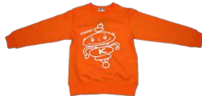
Orange Long-sleeved T-shirt & Sweatshirt