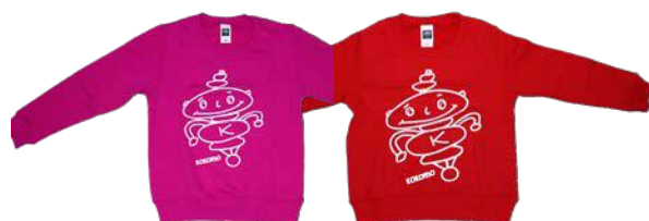
Pink or Red Long-sleeved T-shirt & Sweatshirt